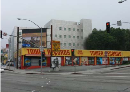
TOWER RECORDS: BRIAN LEWIS, MARATHON

There was significant and heated discussion about the repeated requests over the years for green space - a pocket park or a green zone overlay. This is a major dog walking neighborhood and there is no public green area to service these 1,000 residences, the nearest being over one mile away. There is a great desire to have a part of the neighborhood designated a green zone, especially in light of the city’s expressed commitment to expanding its park system. Part of the Tower property has been suggested in the past, as has part of the Spago’s site. The site of the recently demolished 1217 Horn was also raised as a possibility. A couple of residents will be researching this further.